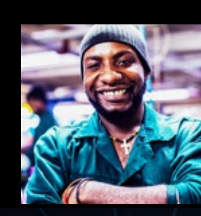
WHAT RESEARCH TELLS US